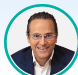
Wael Sawan CEO Shell