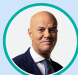
Claudio Descalzi CEO Eni